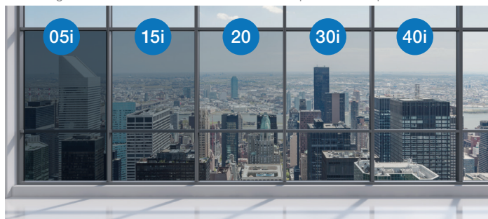
DR OptiTune 05i | DR OptiTune 15i | DR OptiTune 20i | DR OptiTune 30i | DR OptiTune 40i

This image has been simulated and is not actual product comparison